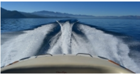
Eagles and Ag