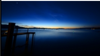
Boating Lake Tahoe