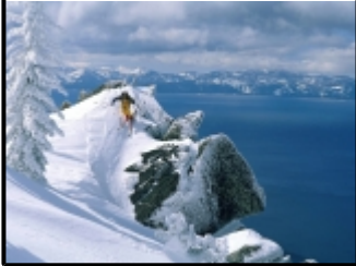
Lake Tahoe Rocks 2