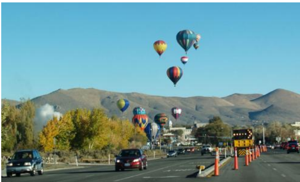
Carson City – Nevada Day Celebrations

The Nevada State Capital and the hub of commerce and retail for the Lake Tahoe Basin and Carson Valley. Carson City is rich in history and the State Capital and government services head quarters make this one of the most vibrant and diverse workforce populations in Northern Nevada.