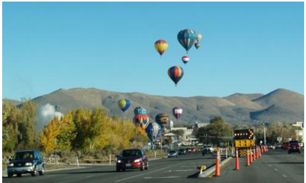
Carson City – Nevada Day Celebrations

The Nevada State Capital and the hub of commerce and retail for the Lake Tahoe Basin and Carson Valley. Carson City is rich in history and the State Capital and government services head quarters make this one of the most vibrant and diverse workforce populations in Northern Nevada.